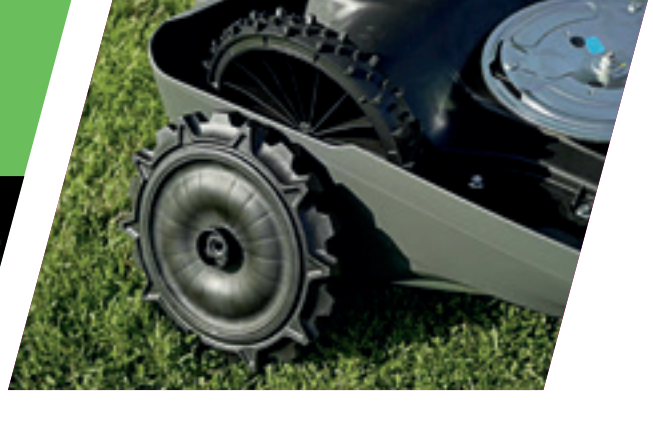
HEAVY DUTY WHEELS